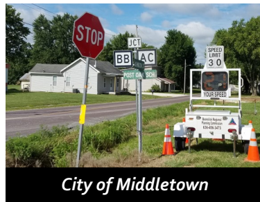
City of Middletown

Recently, the cities of Middletown and Truesdale made use of BRPC's speed trailer. Placing the trailer on a street in your community can bring awareness to drivers who may not realize