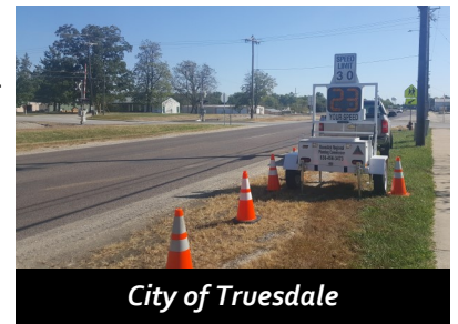
City of Truesdale

Recently, the cities of Middletown and Truesdale made use of BRPC's speed trailer. Placing the trailer on a street in your community can bring awareness to drivers who may not realize