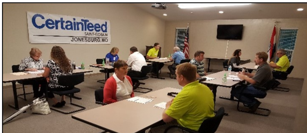
CertainTeed uses BRPC conference room to conduct interviews at its July 2015 Hiring Event