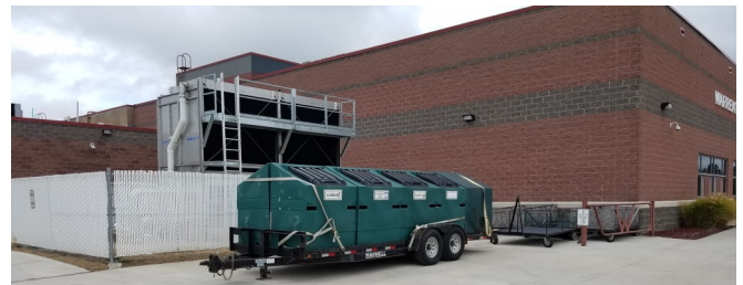
Region I Solid Waste Management District recycling trailer is placed at Warren County R-III High School.

Recently, the Region I District has begun working with staff from the Warren County R-III School District. There is a team of students who are collecting items to be recycled. The district has placed its recycling trailer at the high school and will take the recovered items to the East Central Missouri Recycling Center. The students are collecting aluminum cans, tin cans, cardboard, and plastic bottles. They also collect paper, but have a vendor in place to recycle it.