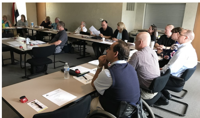
Stakeholders representing a variety of organizations attended to provide input.

A second meeting to update the PTHSTC Plan will be held in January 2018. If you have any questions, please feel free to contact Krishna Kunapareddy at krishna@boonslick.org or call (636) 456-3473