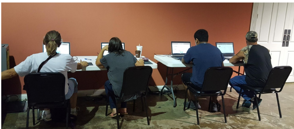
Individuals register on MoJOBS and receive assistance with job searches.