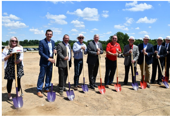
Groundbreaking ceremony for Ranken Technical College Campus in Lincoln County

Additional training opportunities are going to be available for residents in the region. In a collaborative effort, Lincoln County, the Lincoln County R-III School District, the State of Missouri, and Boonslick Regional Planning Commission worked with Ranken Technical College to establish a campus in Troy, Missouri. A groundbreaking ceremony was held in June, with hopes that the facility will be ready for students in the fall of 2021.