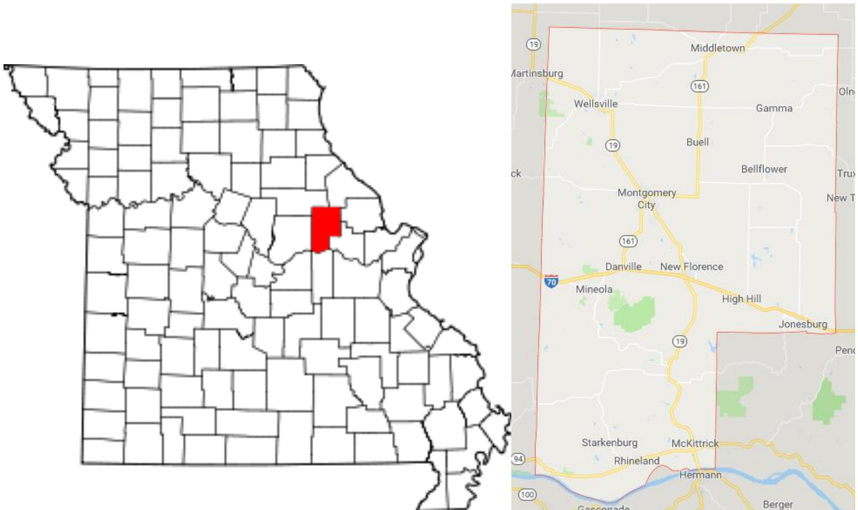
Figure 2.1. Missouri County Map & Political Map of Montgomery County