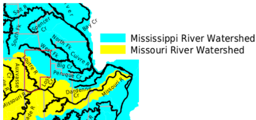
Figure 2.2 Watershed Map (Montgomery County Outlined)