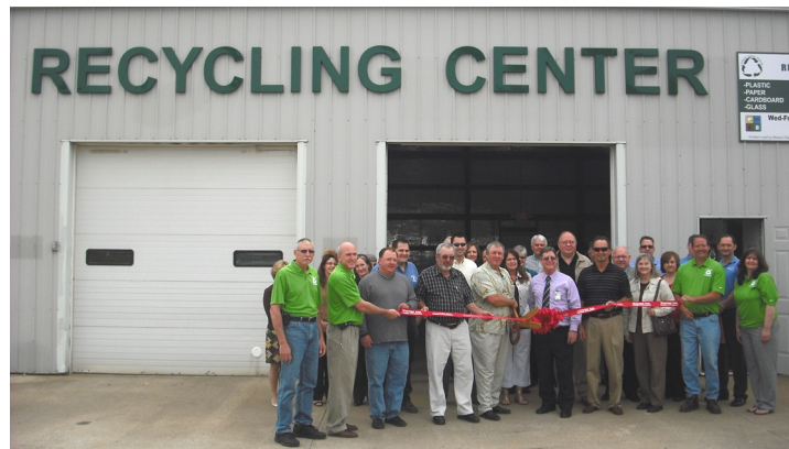
The grand opening ribbon cutting ceremony for the East Central Missouri Recycling Center, April 22, 2010

The East Central Missouri Recycling Center opened its doors on April 22, 2010, which happened to be the 40th anniversary of Earth Day. The facility represents a collaborative effort by local governments to provide opportunities for residents to recycle a wide variety of items. It serves the counties of Franklin, Lincoln, Montgomery, and Warren, which are members of the East